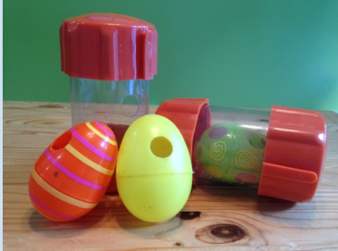
Some examples of rolling food puzzles.

Food puzzles are an excellent way to increase your cat's activity and mental health by giving them a new, more natural way to get their food by "hunting" for it. Food puzzles typically come in two styles, rolling and stationary. They can be purchased or homemade, and can be used with dry or wet food, or treats.