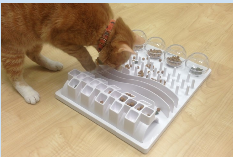
Stationary puzzles can be used with wet and dry food.

Gradually increase the challenge : use puzzles that are opaque, have fewer or smaller holes, or have unique shapes such as a cube, which makes them more challenging to manipulate.